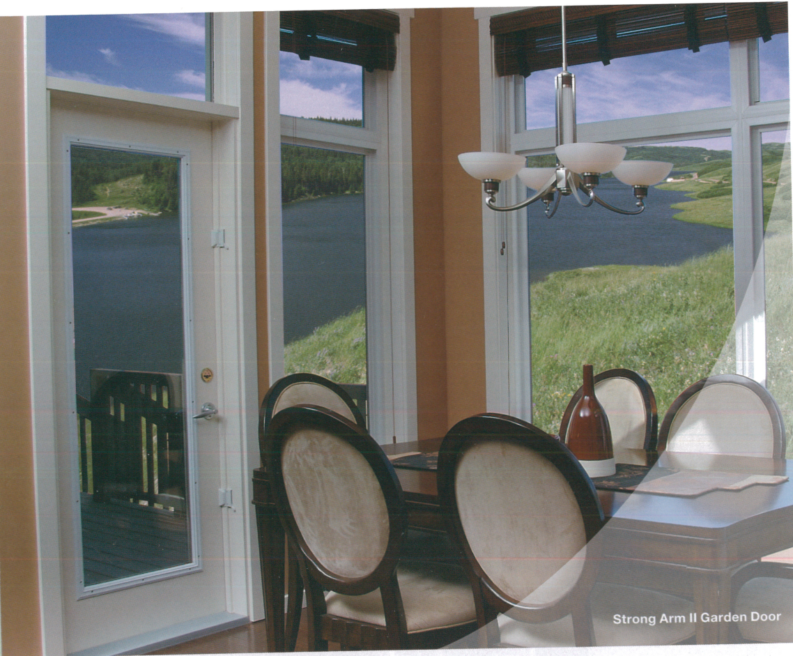
Strong Arm II Garden Door

An urbane upgrade from traditional sliding patio doors, our Garden doors combine style, unique functionality, and low maintenance.